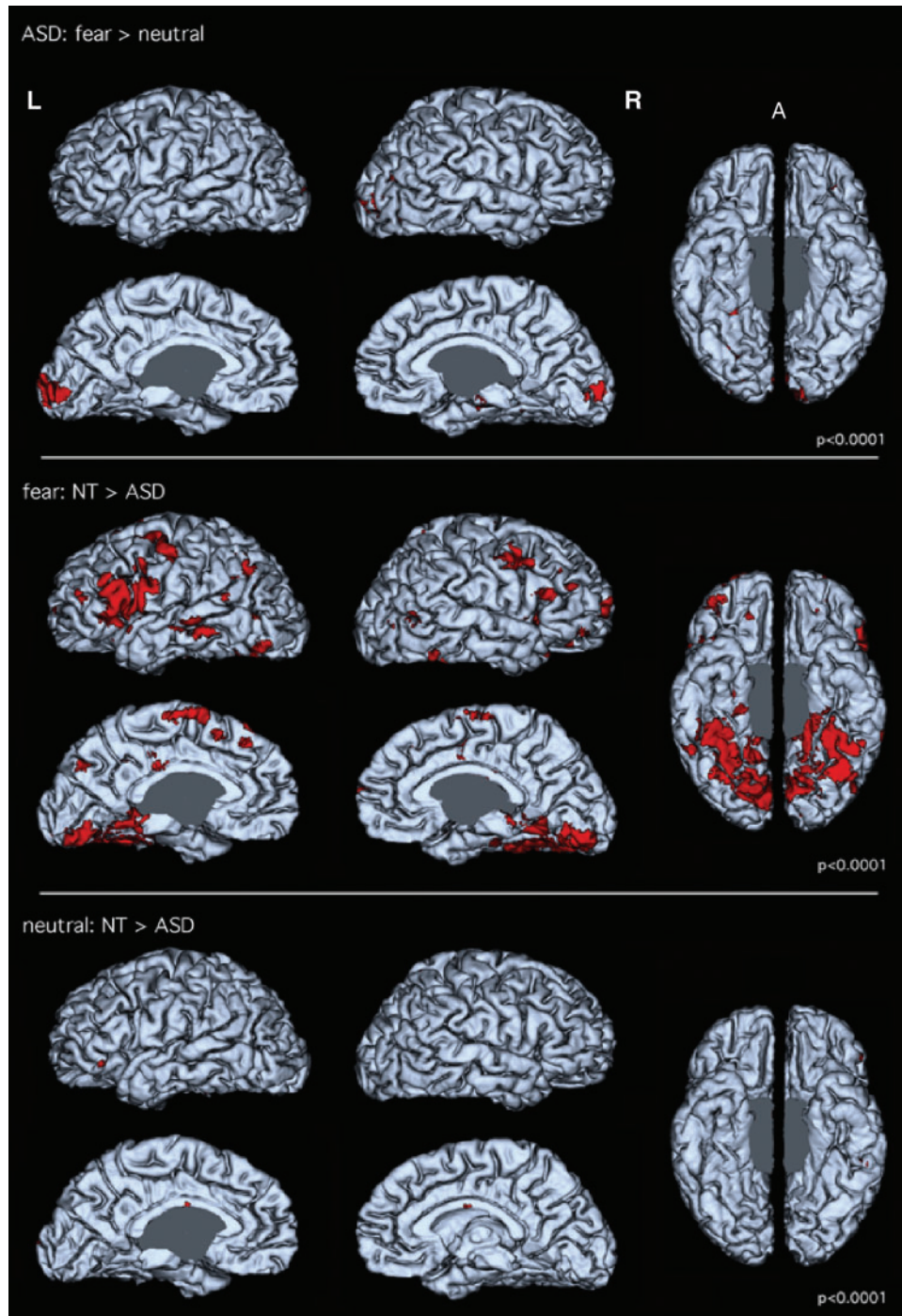
Fig. 2 Lateral, medial and ventral view of 3D reconstructions of a brain. Red indicates areas of significant differences ( P < 10^{-4} ) between conditions (top panel) or between groups (middle and bottom panels). Top panel shows differential activation between Fearful and Neutral condition in the ASD group. Only the striate and extrastriate visual cortex show differential activation. The middle panel shows differential activation between NTs and ASD participants for the fear condition. NT participants show significantly more activation than ASD in the inferior frontal, motor, premotor, temporal and ventro occipito-temporal cortices. The bottom panel shows differential activation between NTs and ASD participants for the neutral condition. Contrary to what is seen for the emotional condition, very little difference is seen, with the presence of more activation for neutral stimuli in NT present in IFC and anterior insula only, ruling out an attentional effect in the results seen in the middle panel.

emotional contagion was absent in ASD participants in the present study.