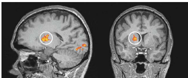
Fig. 3 Right ventral striatum (circled regions) with Talairach coordinates centered at 18.03 \pm 3.40, 2.02 \pm 6.19, 13.60 \pm 4.12 . The high-preference scenes evoked a significantly larger hemodynamic response at the peak value than did the low-preference scenes, t(11)=2.80 , P<0.02 .

With the whole brain analysis, the right, but not the left, ventral striatum showed increased activity (Fig. 3) when compared to the rest condition, with 70 voxels centered on Talairach coordinates (18.03 \pm 3.40, 2.02 \pm 6.19, 13.60 \pm 4.12) . This region included the caudate body, putamen, lateral globus pallidus, and a small portion of the ventral anterior nucleus. A significantly greater peak BOLD response was present in this region for the high-preference responses than in the low-preference responses [ t(11)=2.80 , P<0.02 ]. The earliest cortical visual areas, V1 and V2, showed no differential response as a function of preference, as assessed by the whole brain analysis, t(11)<1.00 . The whole brain analysis did not show above-threshold activation of the amygdala, indicating that the scene selection of the present experiment (by design) did not elicit the kinds of emotions, such as fear, generally associated with activation of that structure.